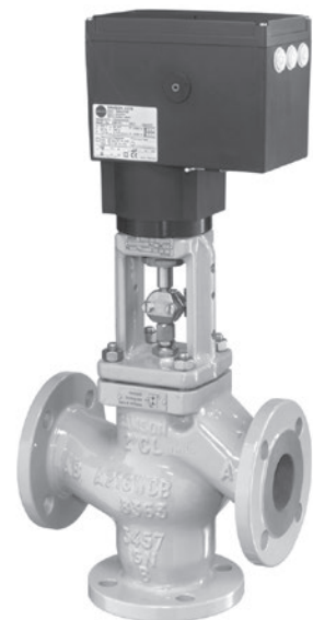
Fig. 2: Type 3244/3374