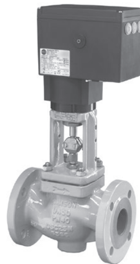
Fig. 1: Type 3241/3374